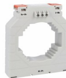
Current transformers DM4T3000